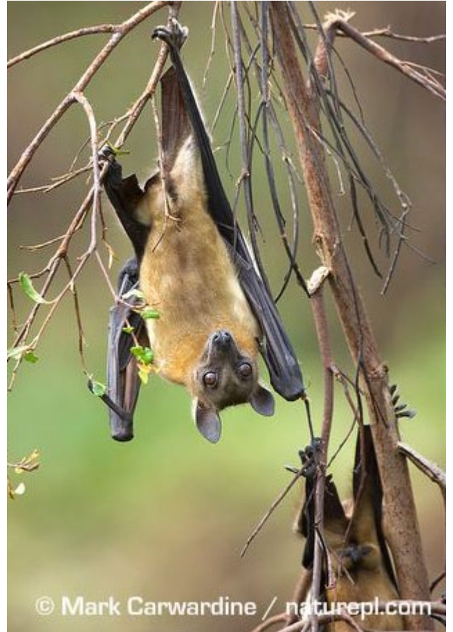
Straw-colored Fruit Bat - Eidolon helvum

Our journey takes us further north and east to the shores of Lake Kariba and the town of Siavonga where our primary target will be the Angola Pitta. (Angola Pitta, Barred Cuckoo, African Emerald Cuckoo, African Broadbill, Livingstone's Flycatcher)